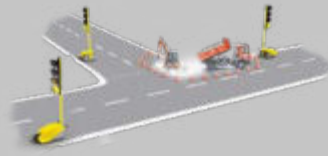
❖ 3 branches junction