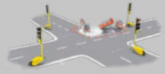
❖ 4 branches junction